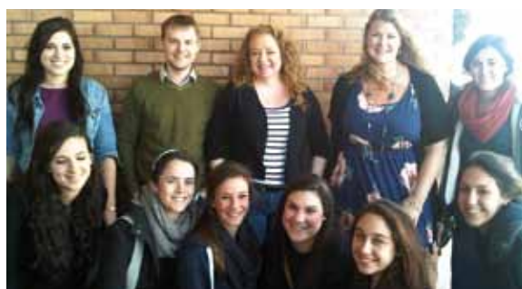
: University Representatives with Local Students

to any of the Russell Group universities so that post graduate students are able to study at a top university in their field of specialisation.