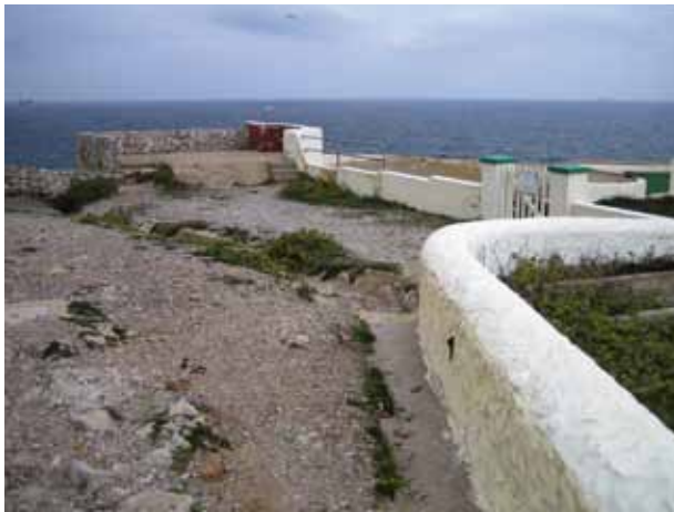
: Europa Before