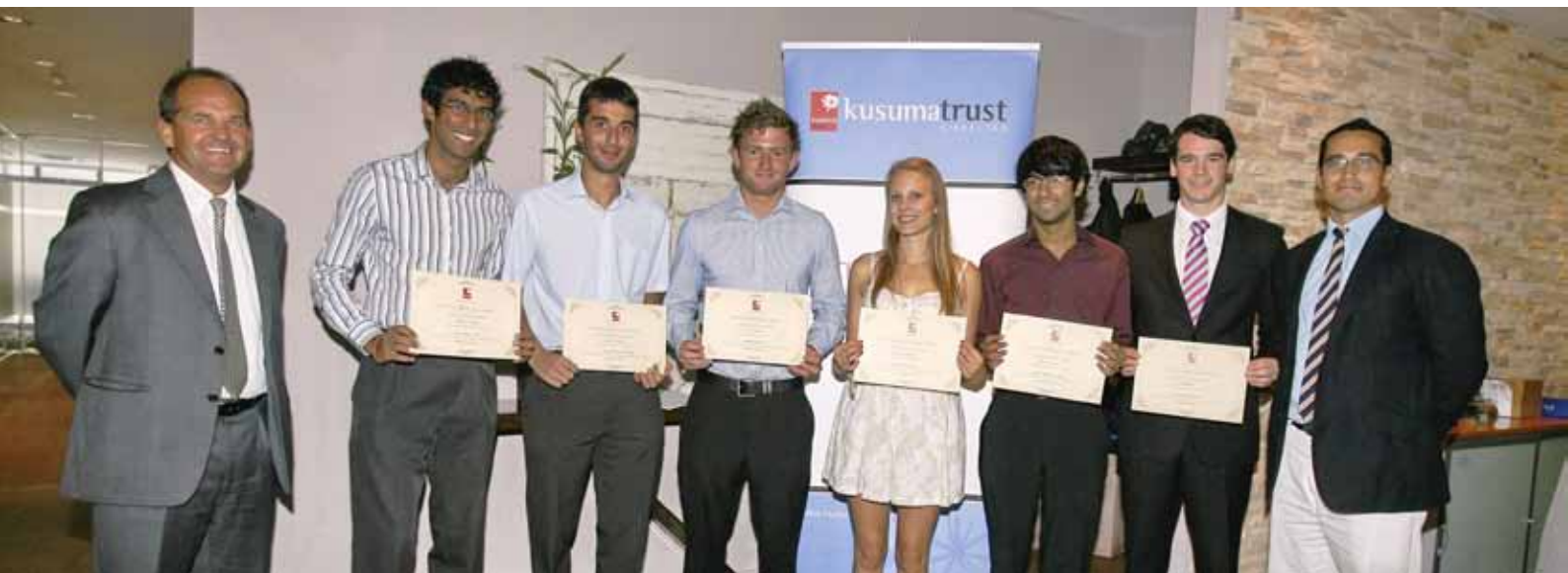
: 2011 Excellence Scholars

2011 was a very active and important year for Kusuma Trust Gibraltar.