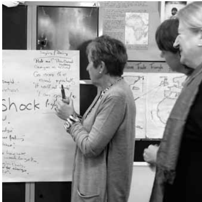
: Directory of Social Change Workshop

The event ran smoothly and was well received by participants with 11 subjects covered throughout the day; Evaluation and Monitoring, Influence and Communication, Business and Strategic Planning, Supporting People Through Change and Making Meetings work were just some of the topics the