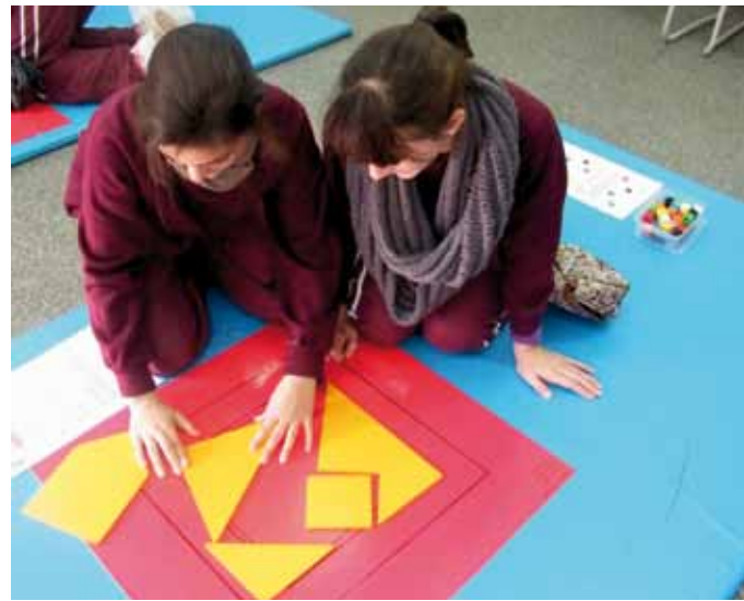
: Millennium Mathematics Project