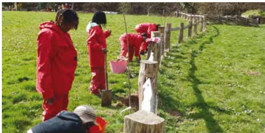
: Top Photo: GX Team Mozambique Bottom Photo: GX Team Development Programmes