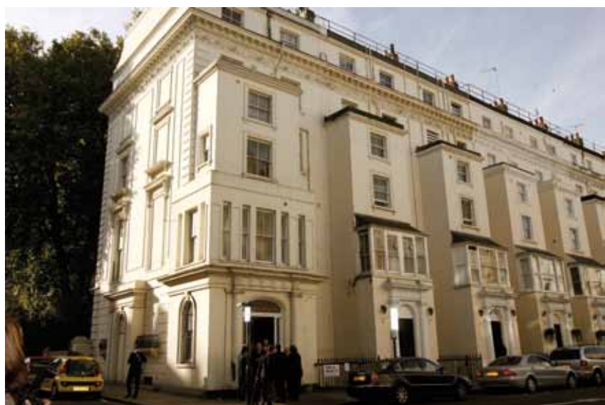
: Calpe House, London

Kusuma primarily encourages a strong focus on sciences, business and maths, at all the school levels from primary to secondary. Hence projects such as the Science Week which brings the outreach team from the British Science Museum into the heart of our schools. So too the successful Maths Week project from Cambridge.