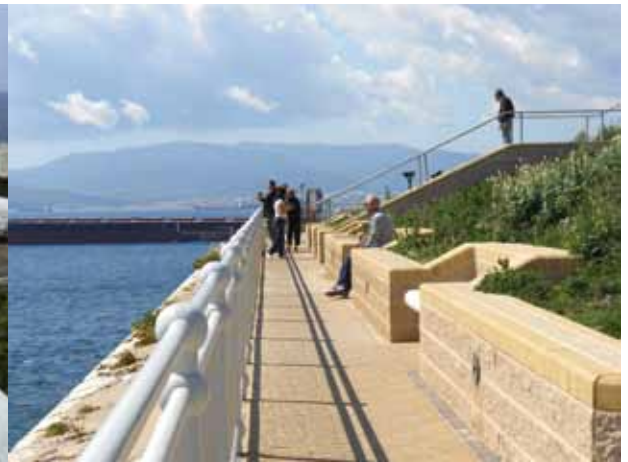
: Europa After