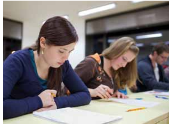
: Distant Learning for Our Community

£25,552.77 has been committed so far for professional development grants for the year 2011–2012. Courses mostly run for 1 or 2 years reducing the incremental impact of costs on this programme.