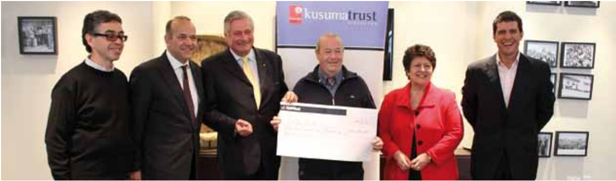
: Calpe House, London 11th December