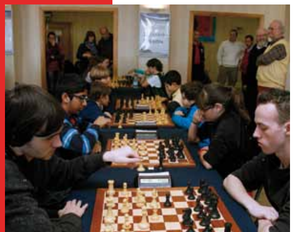
: Gibraltar Junior International Chess Festival

gibraltarchesscongress.com/junior/international2012