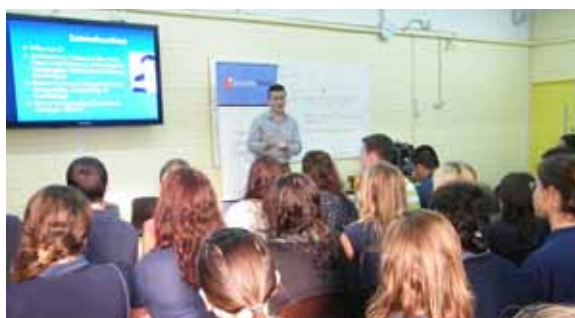
: Student Workshops