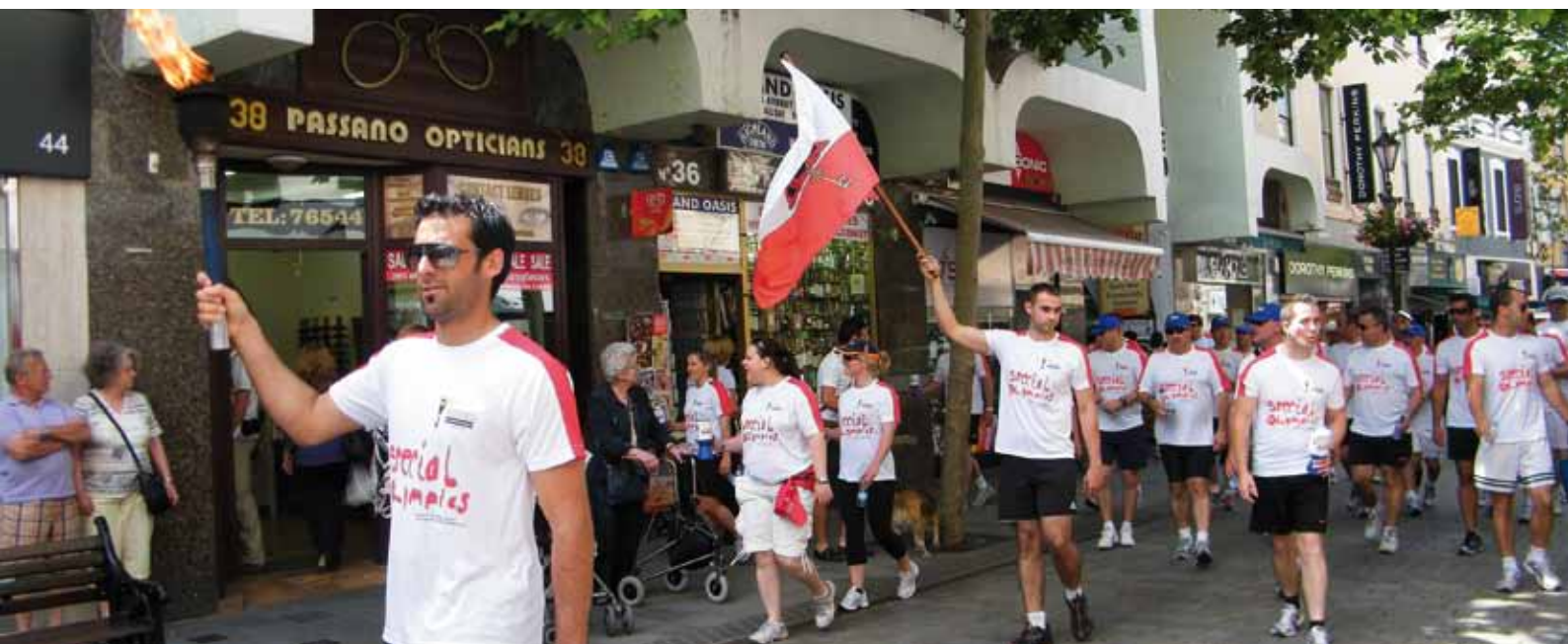
: Special Olympics, Main Street