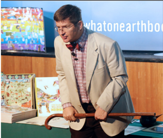
Christopher Lloyd at the Schools Festival