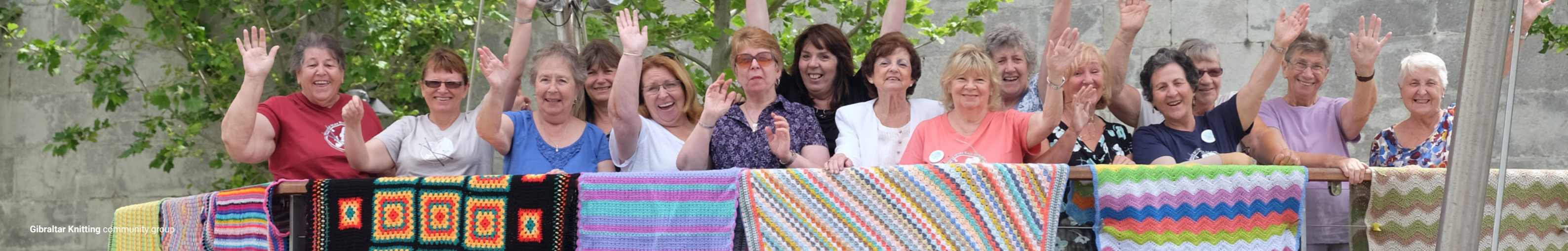
Gibraltar Knitting community group