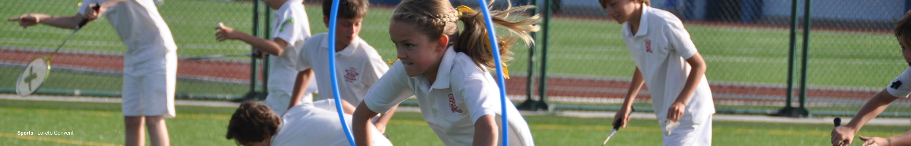
Sports - Loreto Convent