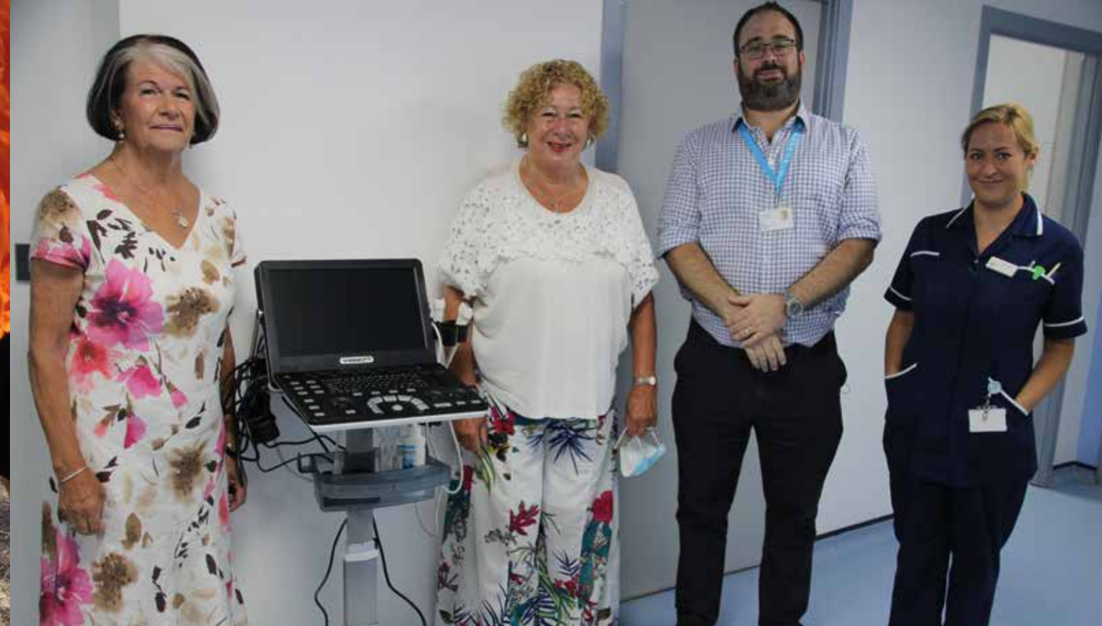
Above: CYE-CYL Facing page: Gibraltar Botanic Gardens, Rotary Club Gibraltar

We have also encouraged individuals to reach their full potential through our Excellence Prize and Professional Development Awards.