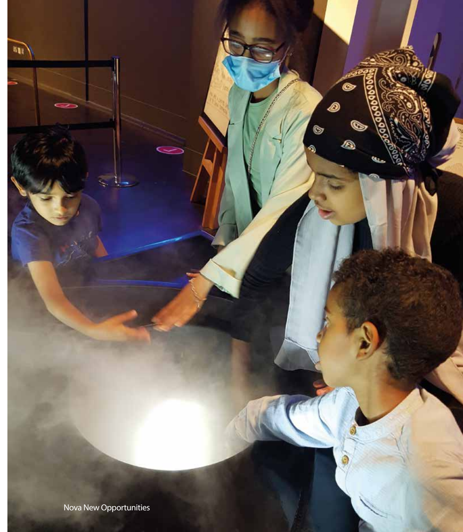
Nova New Opportunities