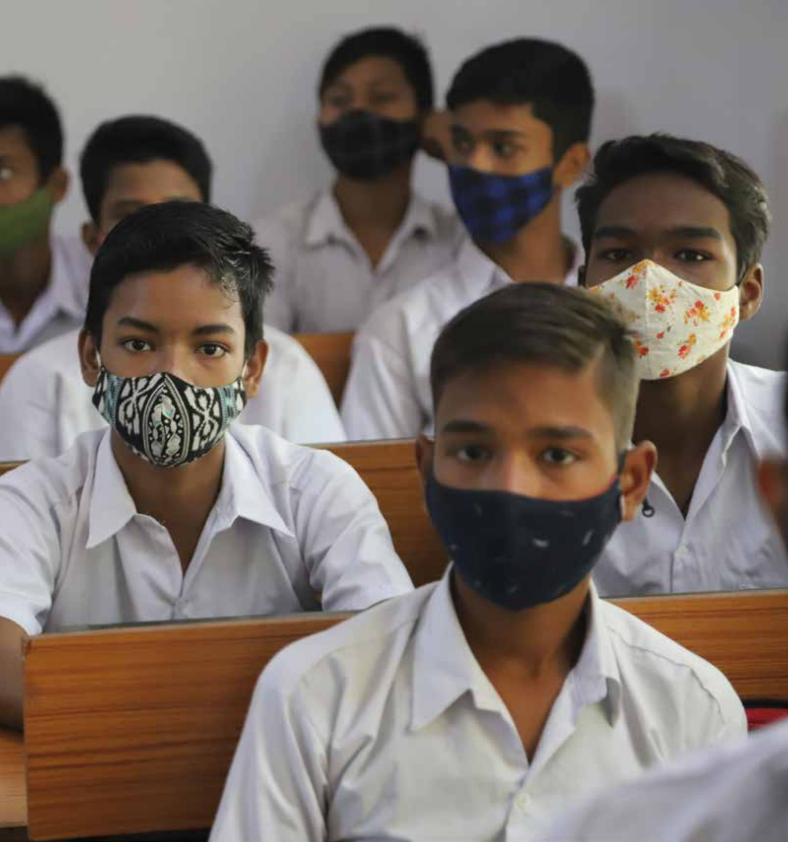
Transform Schools, People for Action