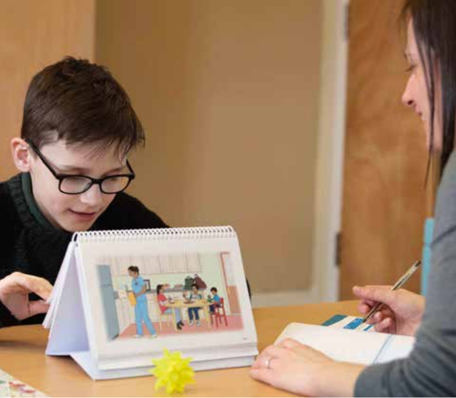
Above: I CAN

young people about the possibilities of science. Our grant has helped the Royal Institution reach a further 21,000 young people and support 840 teachers in 70 schools in disadvantaged areas across London. It's also funded science demo kits, resources and professional development sessions for teachers.