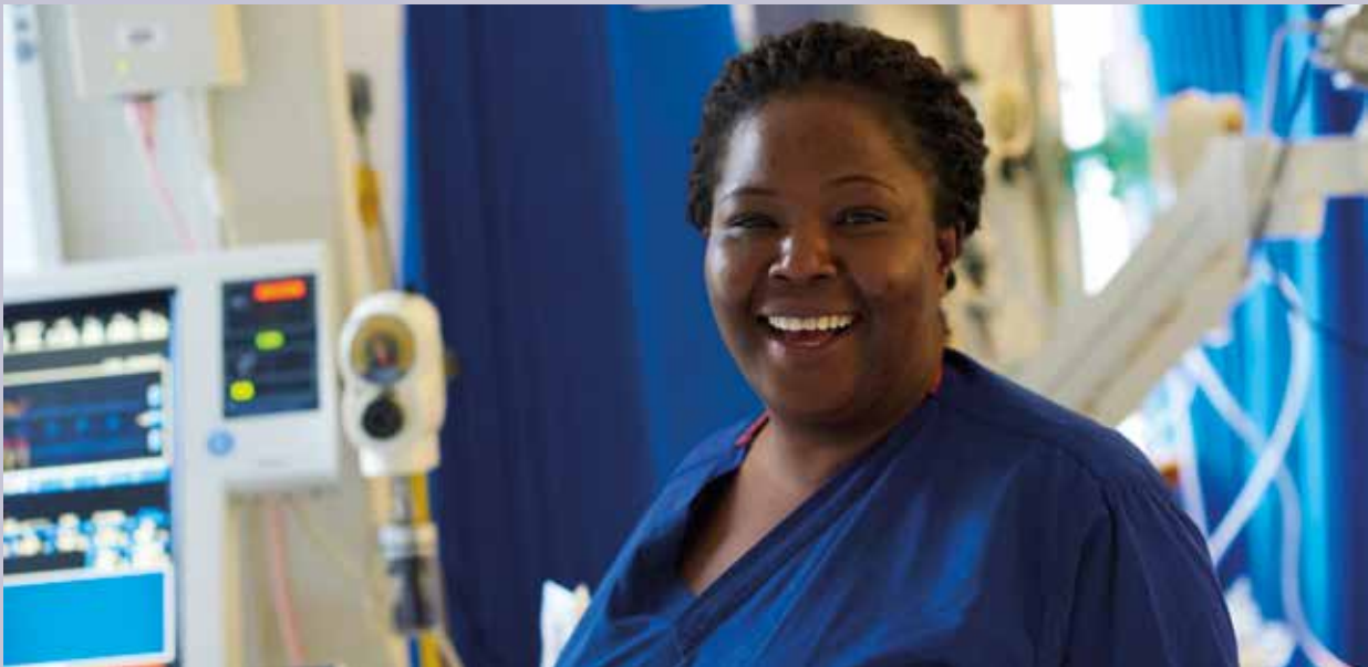
Royal Brompton and Harefield Hospitals Charity