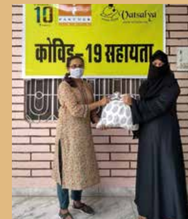
Top: Sree Chitra Tirunal Institute Above: iPartner India Right: People for Action