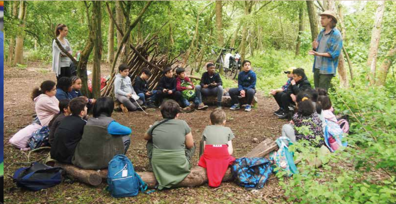
Clockwise from top left: Environmental Research Group at Imperial College London, Royal Brompton and Harefield Hospitals Charity, Beauchamp Lodge, MyBnk