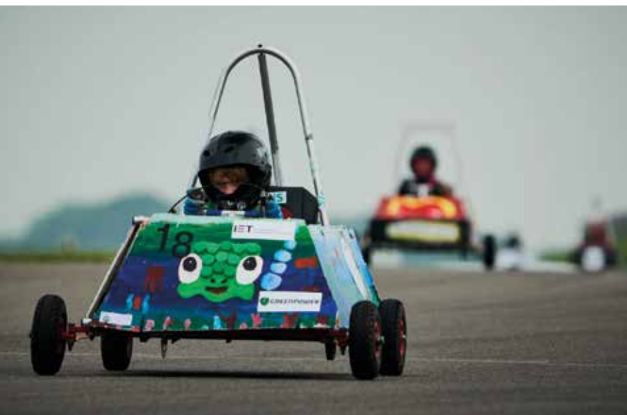
Above: Greenpower Education Trust

Pupils at London schools have the opportunity to design, build and race single-seater electric cars with a team of classmates. Our grant to Greenpower Education Trust is helping 12 schools in lower-income neighbourhoods of London to build their cars. It will also fund a race event in central London.