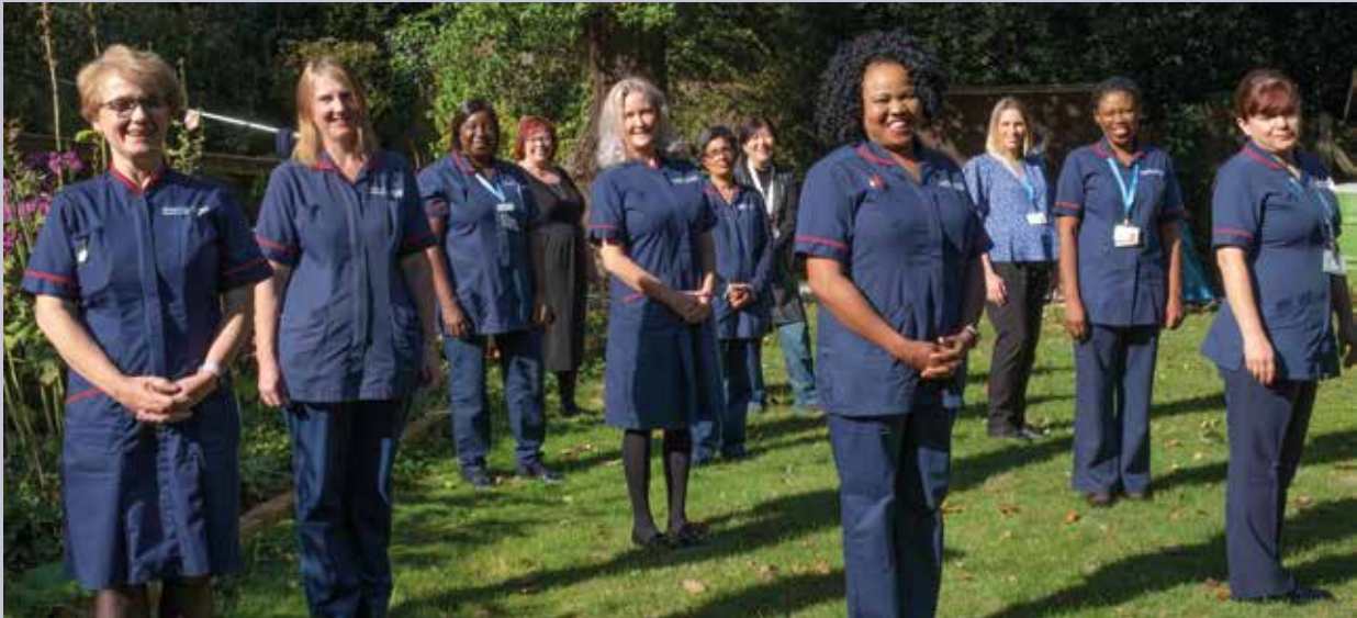
Greenwich and Bexley Community Hospice

University of Cambridge , towards a confocal microscope for the Wellcome-MRC Cambridge Stem Cell Institute and a contribution to artwork in the Institute