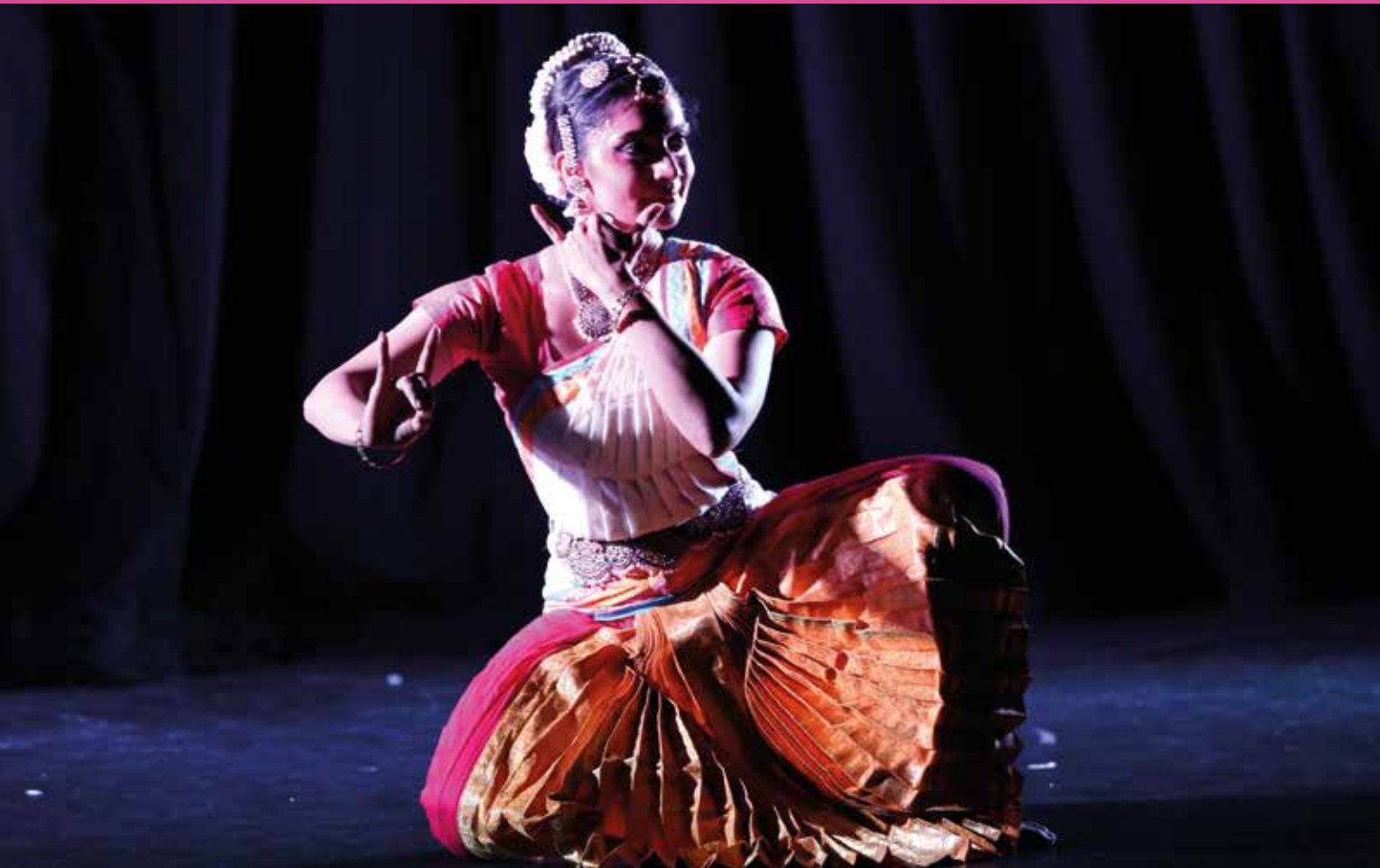
Above: The Bhavan Facing page: Matt Hampson Foundation, Bow Food Bank

Every year during the festive season, we make Random Acts of Kindness grants. These are one-off donations of £10,000 for not-for-profit organisations whose work we want to recognise. Kusuma Trust staff and trustees each nominate a charity to support, anonymously.