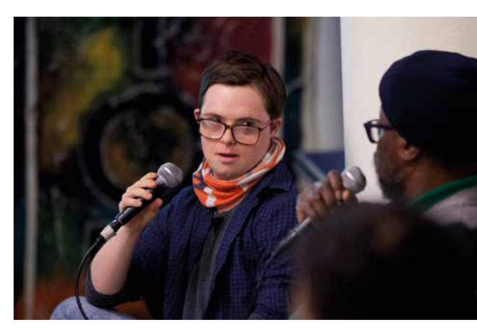
Caxton Youth Organisation

"I am delighted that The National Gallery is able to adopt Articulation. By doing so it will strengthen its connection with thousands of young people in London and across the country, empowering them to express their ideas through exploring the work of inspiring artists, from the past and the present."