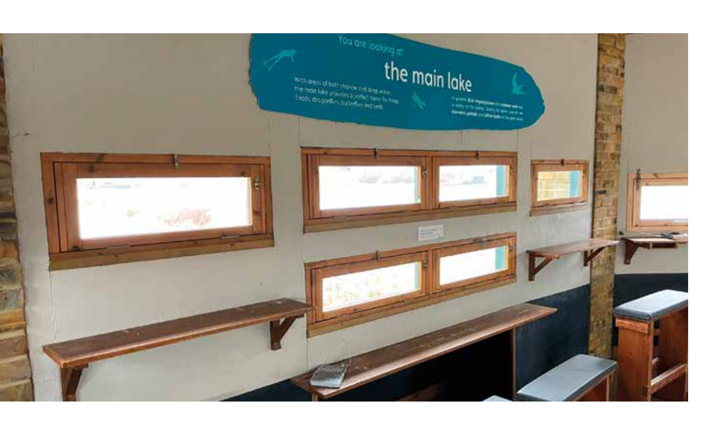
London Wetland Centre

Kensington in spring 2024. The dinosaur will live in a new Jurassic Garden where visitors will be able to fully immerse themselves in prehistoric times. Our grant contributed to this statue and garden, part of the Natural History Museum's Urban Nature Project. It aims to give people, particularly children, the opportunity to understand more about urban nature and ultimately become advocates for our planet.