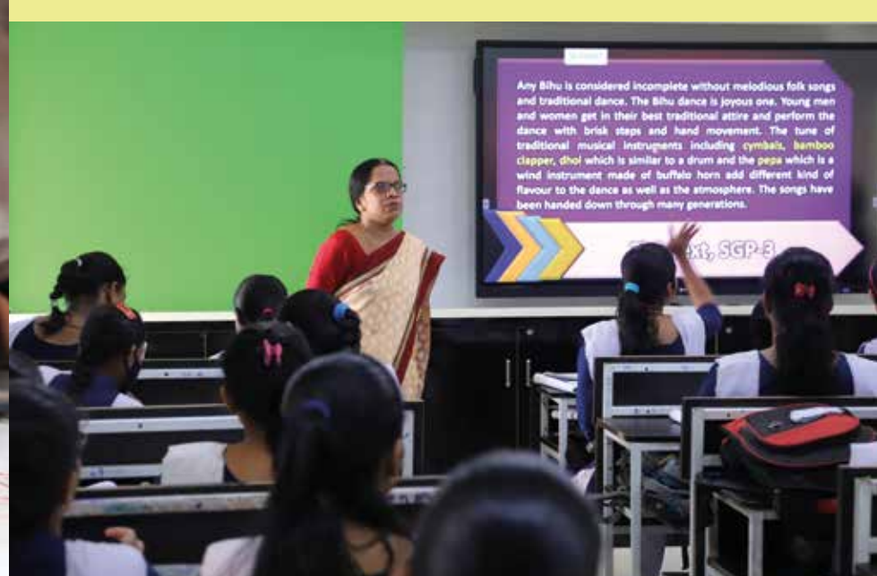
Transform Schools, People for Action

In 2022, we continued to support Transform Schools, a project that's improving the education of millions of children across India, by working with pupils, teachers, head teachers and school governors. We've also awarded grants to our ongoing partners including the well-established Sree Chitra Tirunal Institute for Medical Sciences & Technology to upgrade their pain clinic for older people.